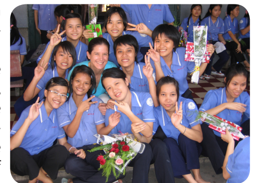
Photos: left - Children at the Thuan An Center in South Vietnam. above - Vietnamese teacher of the deaf and hard of hearing working in the classroom. Children celebrating their new hearing instruments.